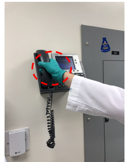
DO NOT TOUCH COMMON SURFACES WITH GLOVES