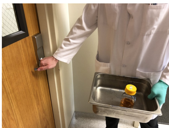
TRANSPORT LAB MATERIALS WITH CARTS, BOTTLE CARRIERS, TRAYS/TOTES, SEALED BAGS, ETC.