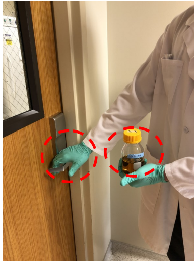
DO NOT TRANSPORT CHEM AND BIO MATERIALS WITHOUT SECONDARY CONTAINMENT