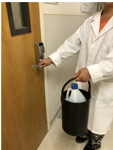
TOUCH DOOR HANDLES WITH BARE HAND AND USE SECONDARY CONTAINMENT