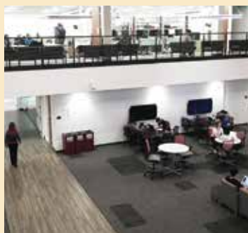
Classroom, lab, study, and collaboration space coexist nicely in Engineering's new digs.

We've been speaking for some time in this publication and elsewhere about the many "surge" moves in progress and prospective facing the School of Engineering in preparation for the final move (now promised for fall 2021) into the magnificent new Sobrato Campus for Discovery and Innovation (SCDI). After all of the talking and planning, here is what has happened.