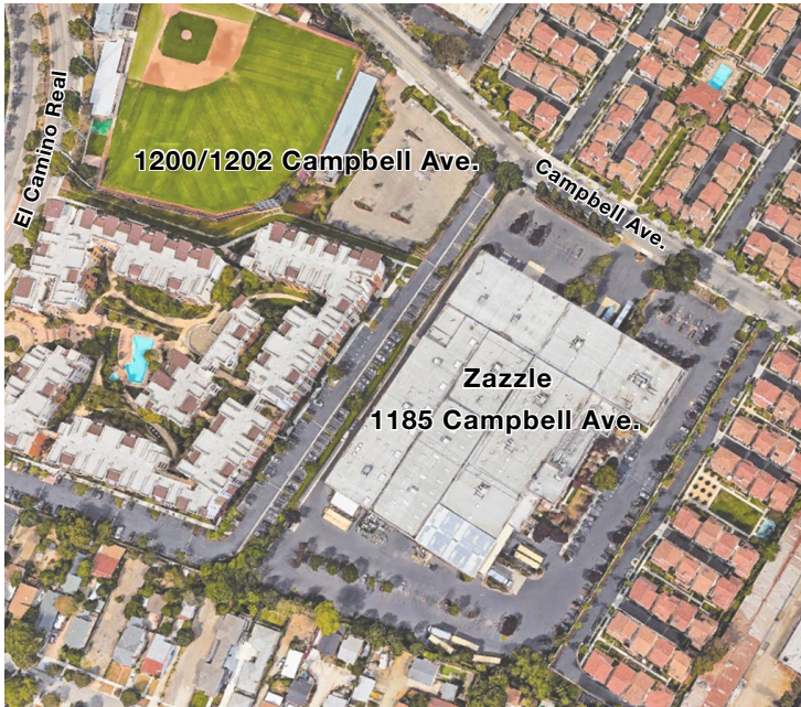
A pair of commercial properties—1200/1202 Campbell Avenue and 1185 Campbell Avenue have been purchased by SCU.

Santa Clara recently acquired a pair of properties off Campbell Avenue.