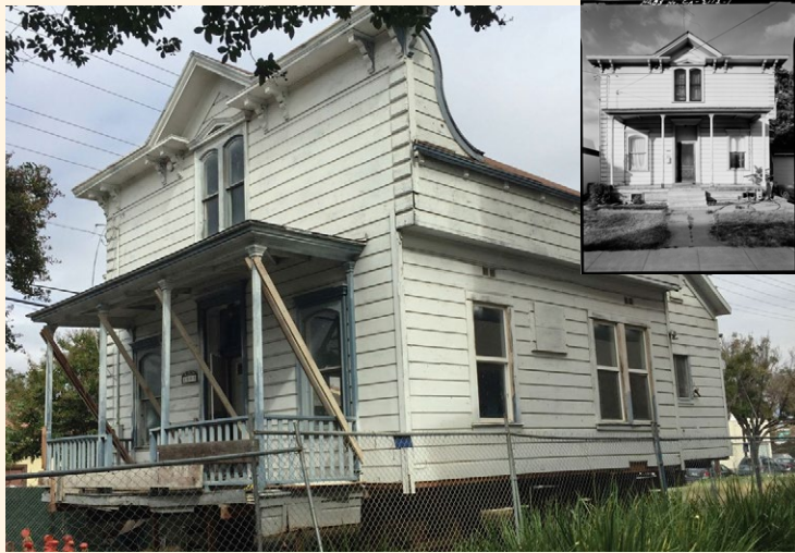
The Larder House has stood in Santa Clara since 1868.

A historic house and key piece of Santa Clara's history