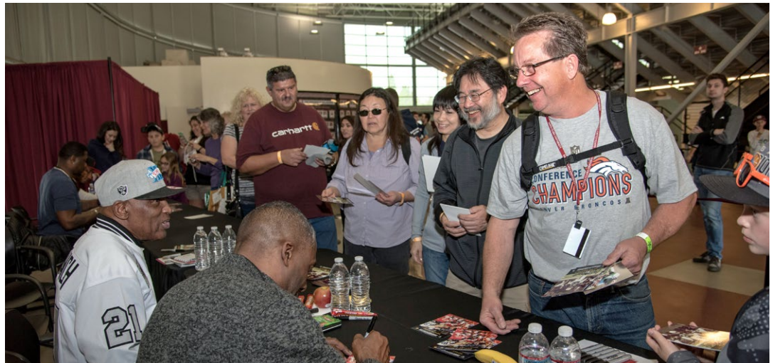
NFL greats—including John Taylor and Cliff Branch—signed autographs and posed for pictures with fans.