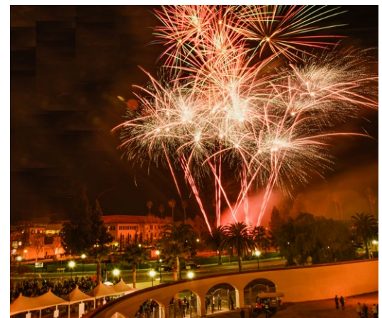
Fireworks filled the sky above the Mission Campus, capping off 10 hours of live entertainment.

Highlights included a celebrity flag football game, a concert by Huey Lewis and the News, and a fireworks finale.